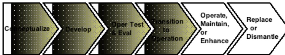
Figure 2 - COSYSMO Life Cycle Scope

Furthermore, as member of the MIT Industrial Liaison Program (ILP), BAE Systems, is planning further collaborative research exchange with MIT that will address additional systems engineering initiatives across the lifecycle beyond cost estimation. In the UK, the Insyte business unit is actively engaging with commercial tool vendors to understand their future plans and how future improvements might be integrated into their existing toolset. Insyte is also actively engaging with the Systems Engineering Innovation Centre at Loughborough with the aim for the SEIC to become the focal point of UK calibration.